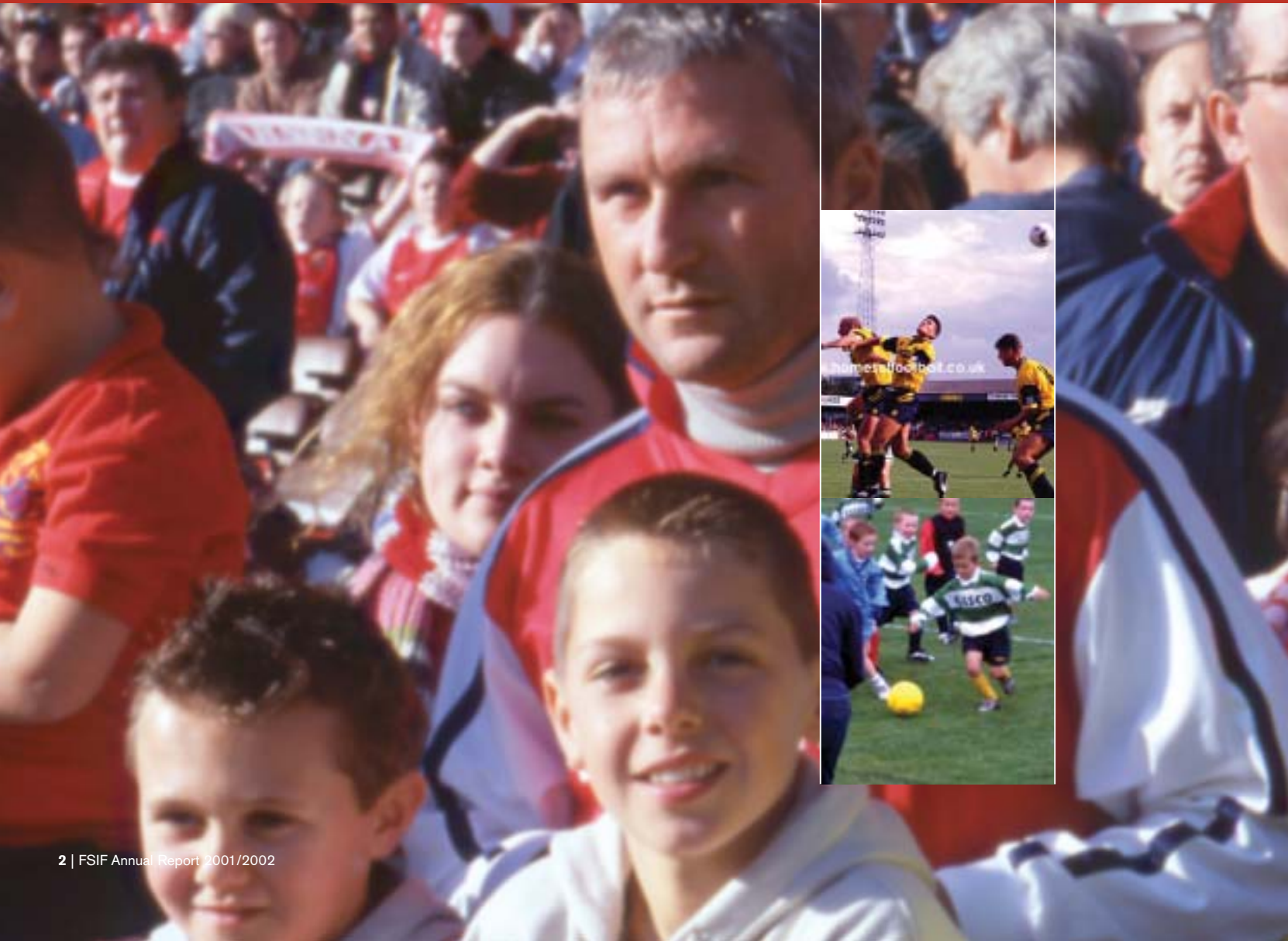
Rt Hon Lord Pendry P.C.

A handwritten signature in black ink, appearing to read 'Tom Pendry'.